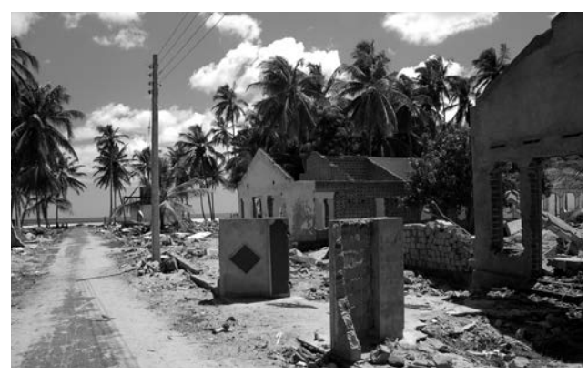
Devastation after the tsunami in the Sri Lankan coast, Thirukkovil village, 2005.

The personal gain was experience that was completely unique at the time about the processes and the ongoing issues in a civil-war and tsunami riddled country on the other side of the world. A huge experience was to see how one of the biggest international humanitarian missions was carried out, as well as to see the following long-term development cooperation projects.